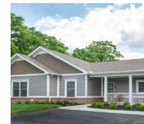
The first Verland Signature Home, located in Monaca

Our new Venango County campus, which opened in May, accommodates 25 individuals who previously resided at the former Polk State Center. Verland North will provide a place of comfort and familiarity to residents while we construct new Verland Signature Homes throughout Venango County.